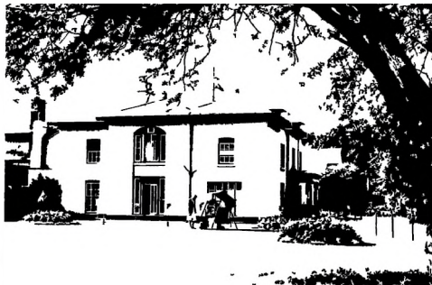
Derwen College founded 1927

Buy toast or a teacake with a hot drink for only £2.50